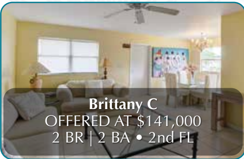
Brittany C OFFERED AT $141,000 2 BR | 2 BA • 2nd FL

Trust The Only On-Site Real Estate Professional Team Specializing in Sales, Listings & Rentals in Kings Point.