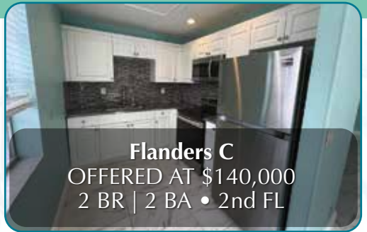
Flanders C OFFERED AT $140,000 2 BR | 2 BA • 2nd FL

Trust The Only On-Site Real Estate Professional Team Specializing in Sales, Listings & Rentals in Kings Point.