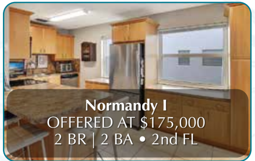
Normandy I OFFERED AT $175,000 2 BR | 2 BA • 2nd FL