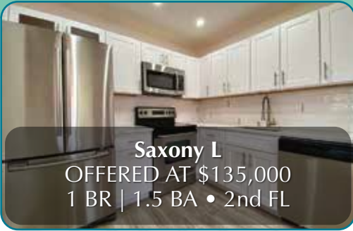
Saxony L OFFERED AT $135,000 1 BR | 1.5 BA • 2nd FL