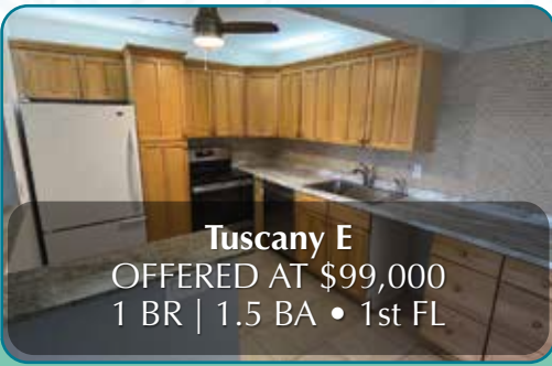
Tuscany E OFFERED AT $99,000 1 BR | 1.5 BA • 1st FL