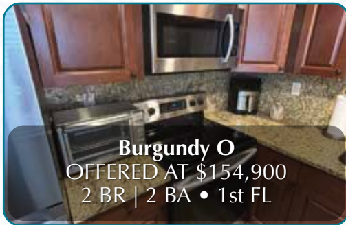
Burgundy O OFFERED AT $154,900 2 BR | 2 BA • 1st FL