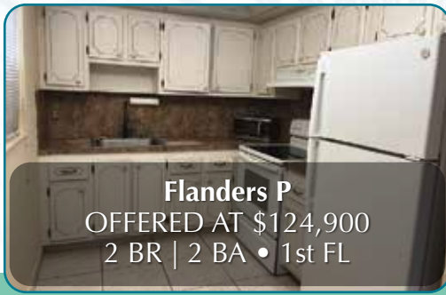
Flanders P OFFERED AT $124,900 2 BR | 2 BA • 1st FL