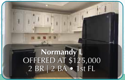
Normandy L OFFERED AT $125,000 2 BR | 2 BA • 1st FL