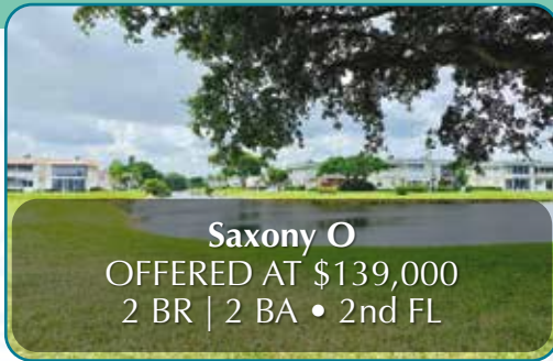
Saxony O OFFERED AT $139,000 2 BR | 2 BA • 2nd FL